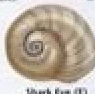
Shark Eye (E)

Tegula funiculata To 1 in. (2.5 cm) Rounded, black shell with a smooth apex.