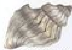
Frilled Dogwhelk (W)

Collusio sp. To 1 in. (2.5 cm) high Pearl-like, strongly ridged shell is as wide as it is high.