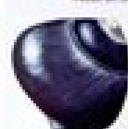
Black Top Shell (W)

Polinices bipartitus To 1 in. (2.5 cm) high Rounded shell is grayish to brownish, (dark to red) to bore holes into biofilms.