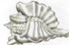
Foliate Thornmouth (W)

Cerithium foliatum To 1.5 in. (3.8 cm) high Shell has three large, leaf-like flanges. Color varies from white to dark brown depending on location.