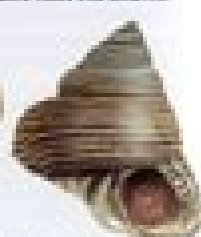
Ribbed Top Shell (W)

Hydrobia ulitiformis To 1 in. (2.5 cm) high Cone-shaped shell is black, to brownish-gray. Feeds on biofilms.