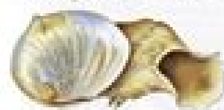
Solitary Glassy Bubble (V)

Conus septentrionalis To 3 in. (7.6 cm) Creamy shell has bands of red-brown splashes. Mouth is a long, dagger out of the narrow end of the shell.