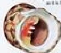
Bleeding Tooth (CB)

Hydrobia ulitiformis To 1 in. (2.5 cm) Brown to white shell has body seal frills and spines. Species found in aquatic waters have smoother shells. Found in intertidal waters.