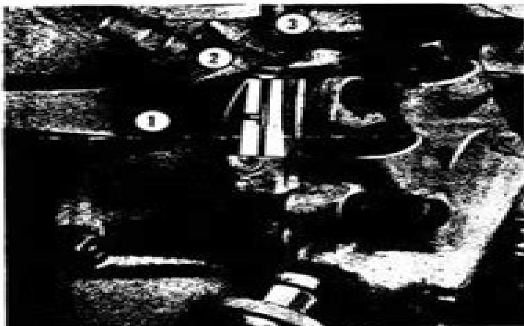
ILLUS. 3 CHAIN OILER ADJUSTING SCREW AND OIL PASSAGE (SIDE VALVE ENGINE)