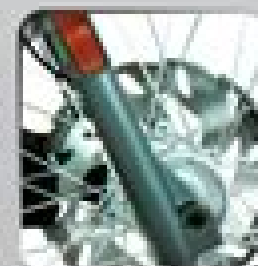
Disco de pétalo delantero y trasero