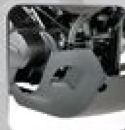
Protector de motor