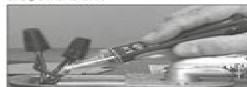
Figure 37 - Non-Contact Circuit Tester

check the power wires to make certain the power is OFF.