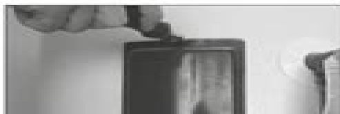
Figure 34 - Access Panel

Remove the upper or lower access panel on the water heater, and then fold back the insulation and remove the plastic element/thermostat cover.