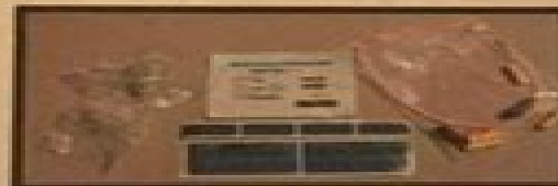
ACCESSORY KIT Spare Mouthpieces, Tamper Seals to be placed at all connections, Posi-Lock and Posi-Tap Connectors with instructions, Zip Ties

THIS MANUAL, ITS CONTENTS, AND ALL WIRING INFORMATION MUST BE KEPT CONFIDENTIAL AND OUT OF THE CUSTOMER'S POSSESSION.