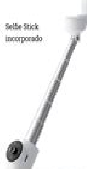
Selfie Stick incorporado