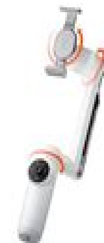
Estabilización de 3 ejes