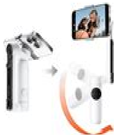
Despliegue rápido en 1 paso