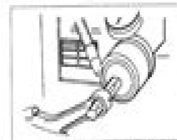
Figure 63: Pressing the Connecting Rod Piston Pin Bushing