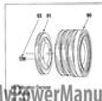
Figure 71: Crankshaft Damper and Pulley