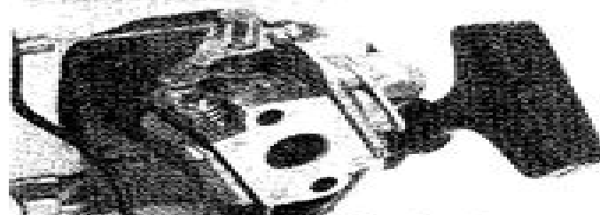
Side No. 8442023-Adjustable carb