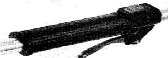
Side No. 8442024