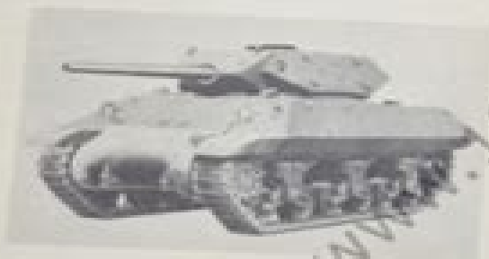
GENERAL ELECTRIC, INC.

General Electric, Inc., Schenectady, N. Y., has developed a new type of engine-driven generator for use in the Navy. This generator is designed to operate at 1000 rpm and is capable of producing 1000 kw. It is the smallest and lightest of its kind and is designed for use in the Navy. It is the smallest and lightest of its kind and is designed for use in the Navy. It is the smallest and lightest of its kind and is designed for use in the Navy.