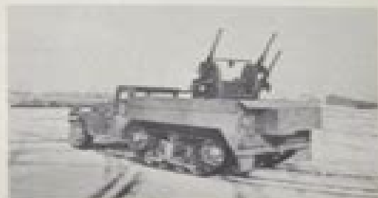
GENERAL ELECTRIC, INC.

General Electric, Inc., Schenectady, N. Y., has developed a new type of engine-driven generator for use in the Navy. This generator is designed to operate at 1000 rpm and is capable of producing 1000 kw. It is the smallest and lightest of its kind and is designed for use in the Navy. It is the smallest and lightest of its kind and is designed for use in the Navy. It is the smallest and lightest of its kind and is designed for use in the Navy.