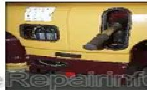
Fig.4.5 - Hand pump

The drive function is not available from the breakdown control panel.