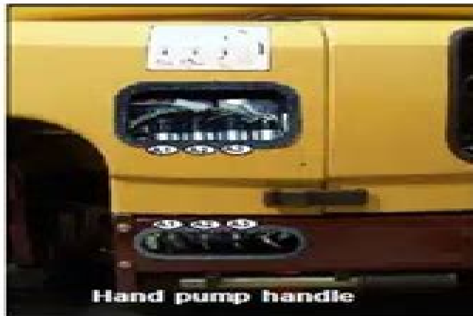
Fig. 4.4 - Breakdown control panel.

Depress the emergency stop switch on the lower control panel. Insert the hand pump handle in the hand pump (fig.4.5.). Activate the handle vertically while activating the manual control push button corresponding to the desired movement.