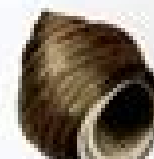
Common Periwinkle (B,V)

Euryspira angulata To 1 in. (2.5 cm) high Shell has 8-10 deep, blade-like ribs.