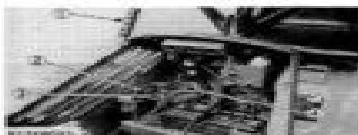
11460-11469 (1) Grip (3) ATA PTO Cable (2) PTO Clutch Lever (4) PTO Clutch Wire