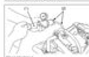
Fig. 1-2-3: Inspect the fan belt