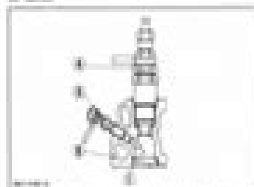
1291-3 (1) Spherical combustion chamber (2) Fuel pump

The cross-flow type intake/exhaust ports in the cylinder head have their openings at both ends of the cylinder head. Because the casting between the intake/exhaust ports is less than that of conventional types having all ports on one side, the stream in air is prevented from being heated and expanded by the exhaust gases. The cool, high density suction air has high volumetric efficiency and raises the power of the engine. Furthermore, deceleration of the cylinder head by heated exhaust air is reduced because suction ports are arranged alternately. The combustion chamber is of Scania's unique spherical combustion chamber type. Fuel air is mixed to be mixed effectively with fuel, promoting combustion and reducing fuel consumption.