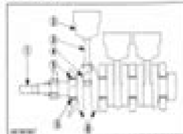
1291-4 (1) Crankshaft (2) Main bearing (3) Connecting rod (4) Piston (5) Crankshaft bearing (6) Crankshaft bearing (7) Piston (8) Connecting rod (9) Piston

The crankshaft (1) is driven by the piston (2) and connecting rods (3) and carries reciprocating motion into rotary motion. It also drives the oil pump, camshaft and fuel camshaft. The counterweights (4) are integrated into the unit to minimize bearing wear and lubricating oil temperature rise.