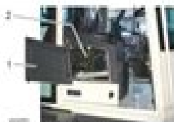
Figure 1. The study area.