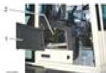
Fig. 386 Fuses in the driver's cab