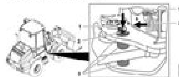
Fig. 88 Engaging the articulation lock

1 Spring pin 2 Pin 3 Index a Articulation lock engaged b Articulation lock released