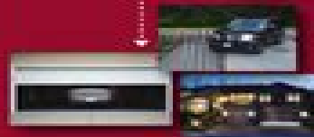
Open/Close Garage Doors, Gates and Turn On Lights