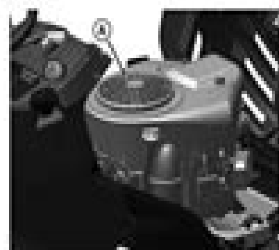
Air cleaner cover (A) and air cleaner element (B)