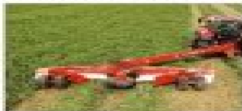
Working in the field