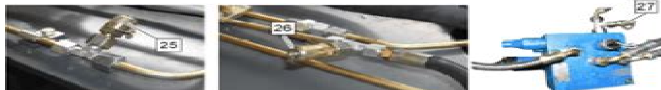
Fig. 44 Measuring points of the brake system