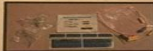
ACCESSORY KIT Spare Mouthpieces, Tamper Seals to be placed at all connections, Posi-Lock and Posi-Tap Connectors with instructions, Zip Ties

THIS MANUAL, ITS CONTENTS, AND ALL WIRING INFORMATION MUST BE KEPT CONFIDENTIAL AND OUT OF THE CUSTOMER'S POSSESSION.