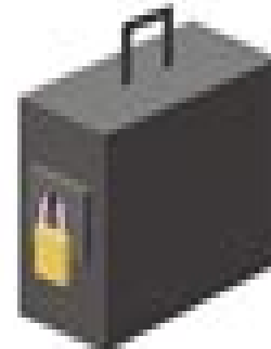
Lock box for ammo