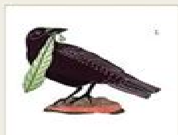
Qavookuk Mavookuk Summer Bird / Oiseau d'été, 2005