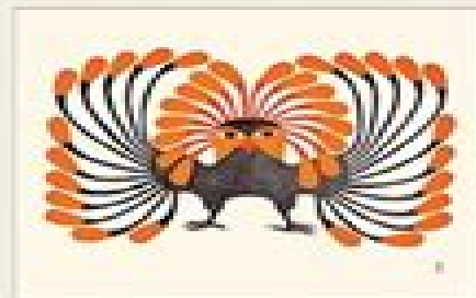
Kinngmikuk Aukook Autumnal Owl / Hibou d'automne, 1999