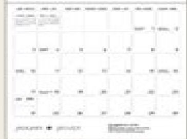
Kinukuk Sugavookuk April, 2014