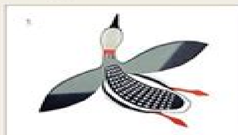
Qavookuk Mavookuk Ascending Bird / Oiseau d'été, 2005