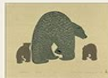
Kinngmikuk Pookoogook Alligator (Bear with Cubs) / Ourson avec ses petits, 1997