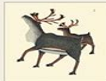
Kinngmikuk Pookoogook Sign of Summer / Signe de l'été, 2008