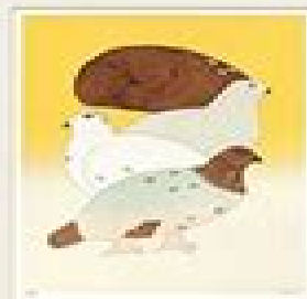
Kinngmikukuk Tawook Four Seasons / Les quatre saisons, 2005