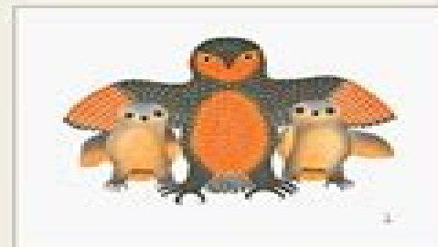
Nikukuk Jook Owls at Twilight / Hiboux au crépuscule, 2004