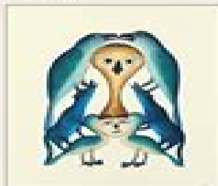
Kinngmikuk Aukook Protective Healer / Médecin protecteur, 2012