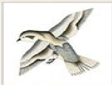
Qavookuk Mavookuk Blue Bird / Oiseau d'été, 1993