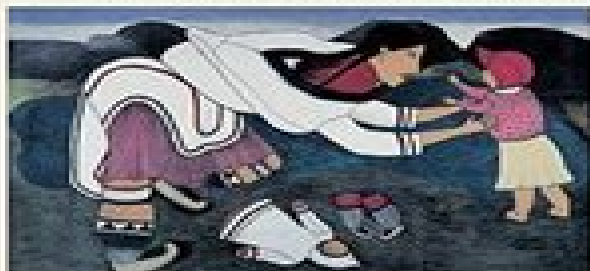
Nagavik Pookoogook My Daughter's First Steps / Les premiers pas de ma fille, 1990