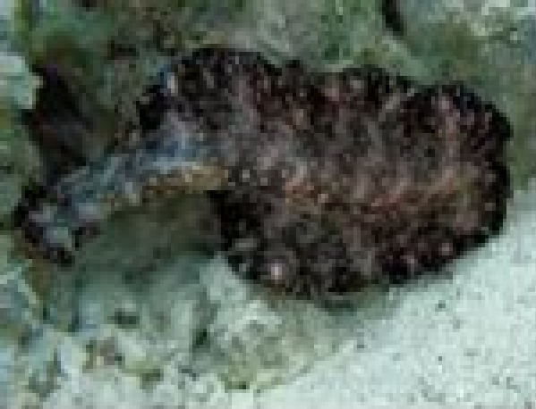
Flatworm: Pseudobiceros bedfordi