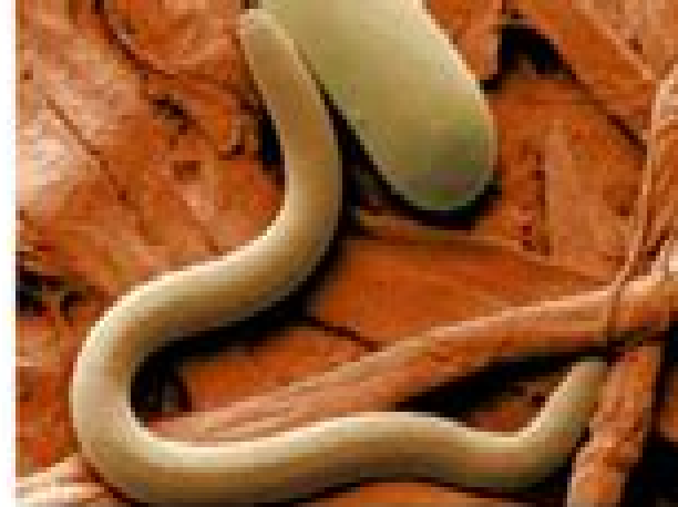
Nematode: Heterodera glycines