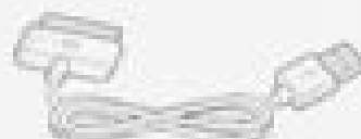
Dock Connector to USB Cable

10W USB power adapter: Use the 10W USB power adapter to provide power to iPad and charge the