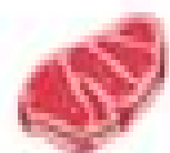
Heme iron Fe 2+