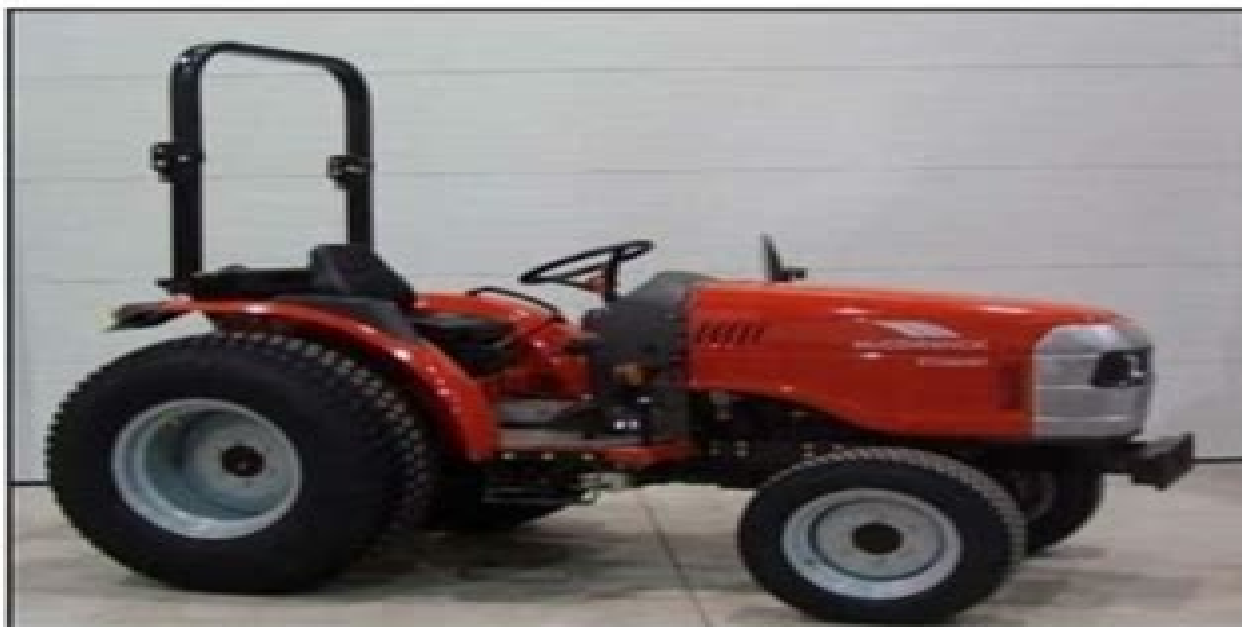
McCormick CT41 and CT47 Series Tractors