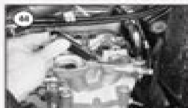
Measuring the valve clearance