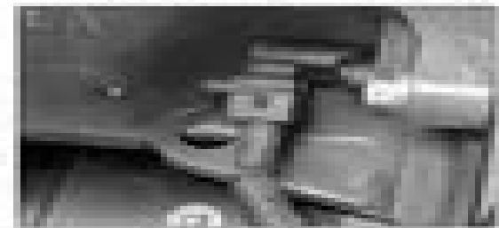
2.11f Engine air-cut-off position sensor and multi-plug