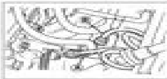
2.11d Fuel supply (A) and return (B) hose connections at the fuel pump