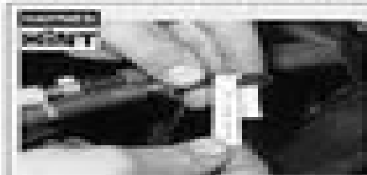
2.11c Remove the coolant hose (A) and the fuel hose (B) from the thermostat housing. Always label them clearly, so that they can be correctly reconnected. Marking tape another 4-inch or joint application work used for marking them. Take safety precautions, or avoid the ingress of components and liquids.