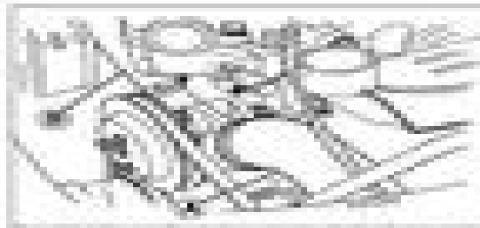
2.11b Disconnect the coolant hose (A) and the heater hose (B) from the water pump

5. Release the retaining clip and detach the