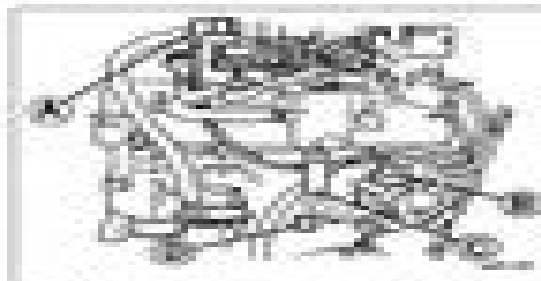
2.11e Wiring connections to the 200.0°C engine