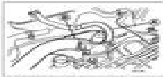
2.11a Disconnect the coolant hose (A) and the fuel hose (B) from the thermostat housing

2. Referring to Chapter 4 for details, drain the coolant and engine oil. Plug the drain plug to the sump-to-completion.