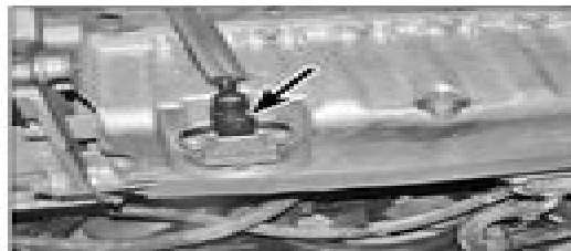
14.4 Disconnect the wiring connector from the oil level/temperature sender