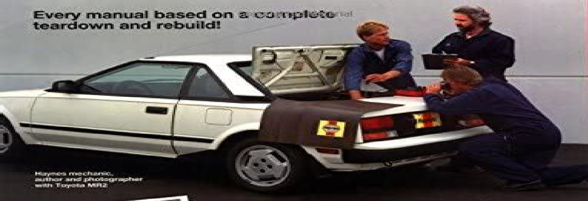
Haynes mechanic, author and photographer with Toyota MR2

Every manual based on a complete teardown and rebuild!