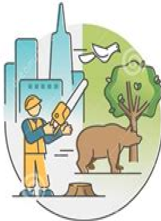
HABITAT LOSS FOR WILD ANIMALS