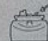
RIGHT SIDE FRAME VIEW

CONNECTOR LUBRICATION 1 DROP (SPREAD ON INDICATED AREAS)