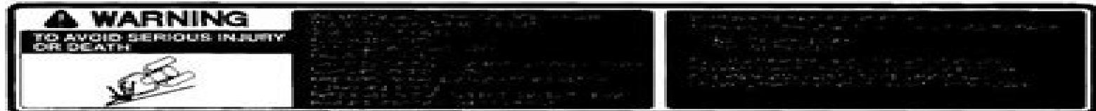
(2) Part No. K3211-6582-2