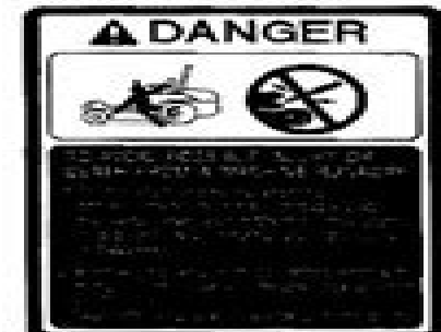
(2) Part No. K3211-6583-1