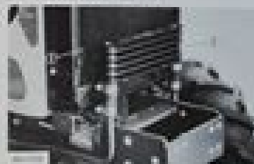
(1) Heat pipe (2) Oil Cooler