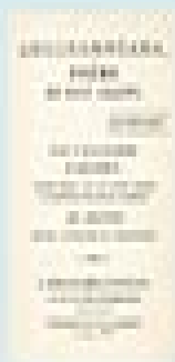
Anagrammiana, poems on hull charts