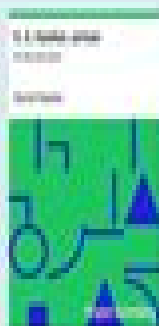
H. G. Hawker, airman: his life and work