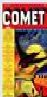
Lord of the Silent Death