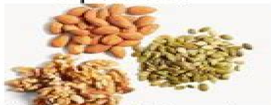
Nuts and Seeds