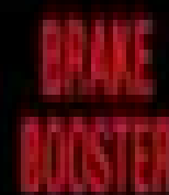
Brake booster warning light