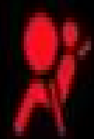
SRS airbag warning light