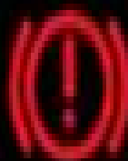
Air pressure warning light