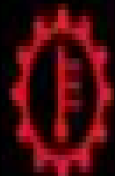
Automatic transmission fluid temperature