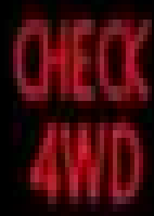
Check 4WD warning light