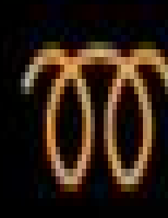
Glow plug indicator light