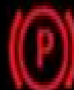
Parking brake warning light