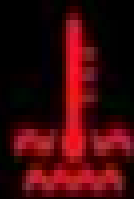
Engine overheat warning light