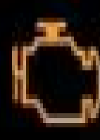
Check engine warning light