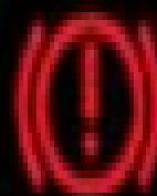
Brake system warning light