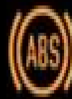
ABS warning light