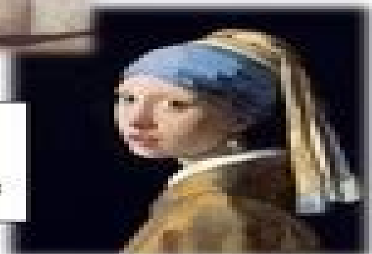
Girl with a Pearl Earring by Johannes Vermeer