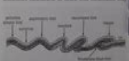
Fig. 19 Types of folding.

is formed (Fig. 19). If it is pushed still further, it becomes a recumbent fold (Fig. 19). In extreme cases, fractures may occur in the crust, so that the upper part of the recumbent fold slides forward over the lower part along a thrust plane , forming an overthrust fold . The over-riding portion of the thrust fold is termed a nappe (Fig. 19). Since the rock strata have been elevated to great heights, sometimes measurable in miles, fold mountains may