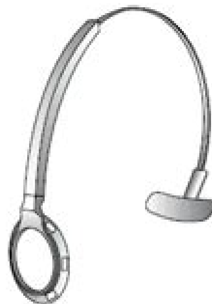
Replacement headband attachment