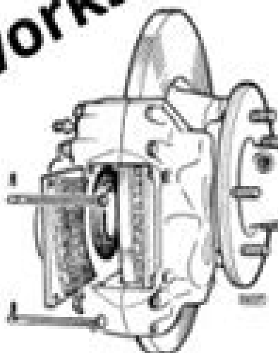
Fig. No. 7 Piston pin removed

In order to replace the pistons and seals, or change the rubber dust covers, it will be necessary to remove the caliper from the car as detailed on page 1, 13.