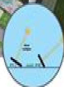
Best Energy-saving Angle