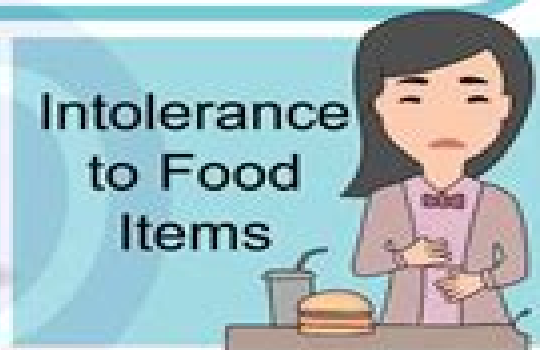
Intolerance to Food Items