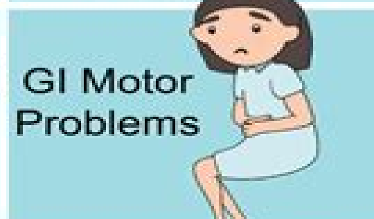
GI Motor Problems