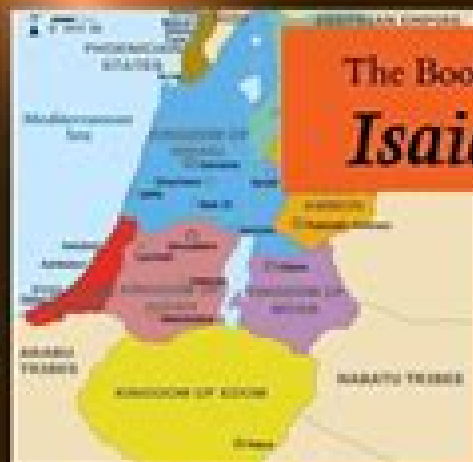
The Book of the Prophet Isaiah 1-39