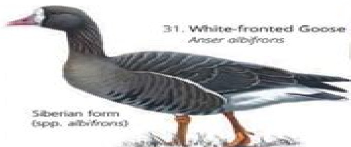
Siberian form (spp. albifrons)