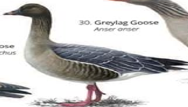
30. Greylag Goose Anser anser