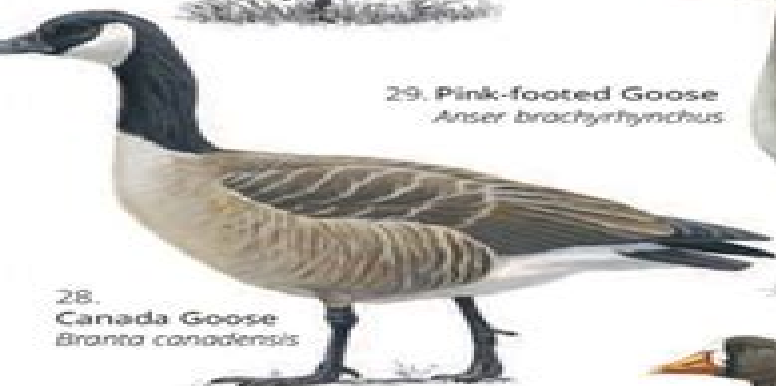
28. Canada Goose Branta canadensis