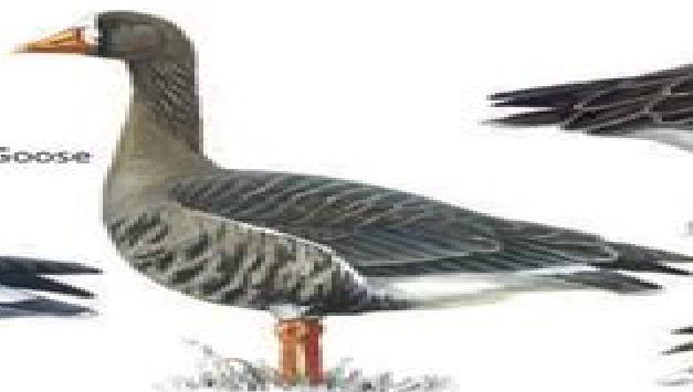
Greenland form (spp. flavirostris)