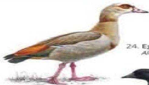
24. Egyptian Goose Alopochen aegyptiaca