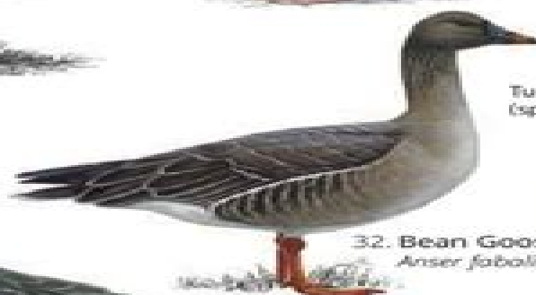
Tundra form (spp. rossicus)