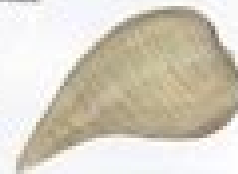
Common Fig Shell (CB)

Hydrobia ulitiformis To .75 in. (2 cm) Very fragile white to yellowish shell has a delicate lip. Shells are so light they are often transported to the highest tide line.