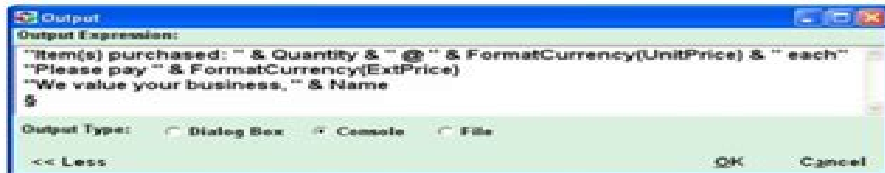
Adding FormatCurrency function (in two locations)

Visual Logic has a number of built-in functions. The FormatCurrency function can produce better output for the UnitPrice and ExtPrice in our sample program. To use FormatCurrency, identify the variable to be formatted inside the parentheses ( ) as shown next.