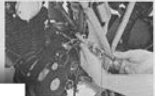
10 mm BOLT (7)

1. Use the correct keys to insert engine bolts.